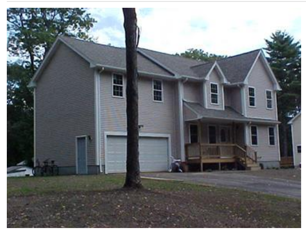
(PhotoHandler.ashx?pid=14739&bid=14739) Building Layout