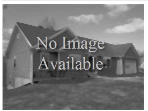
(http://images.vgsi.com/photos/CumberlandRIPhotos//default. Building Layout