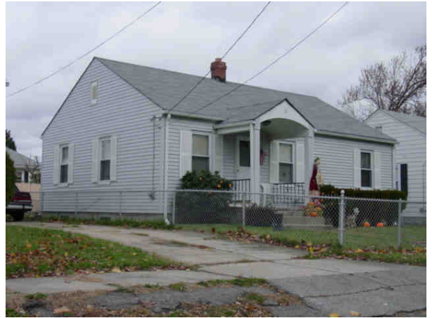
( http://images.vgsi.com/photos/JohnstonRIPhotos//\00\00\12/ )