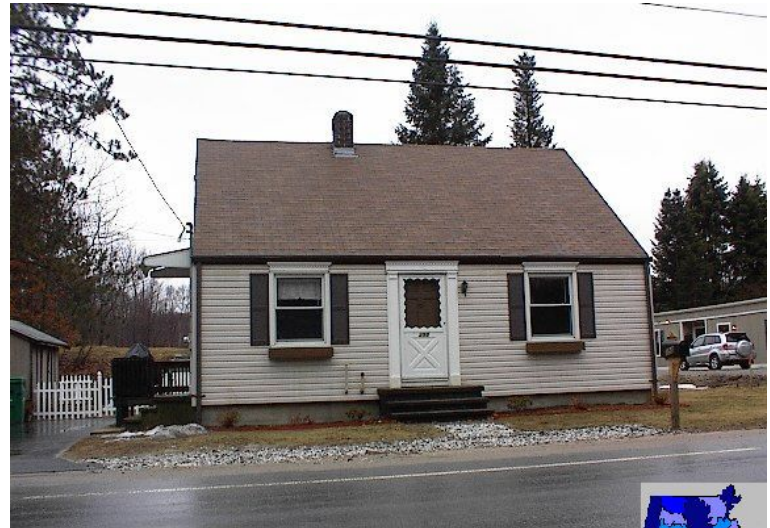
398 DOUGLAS ST