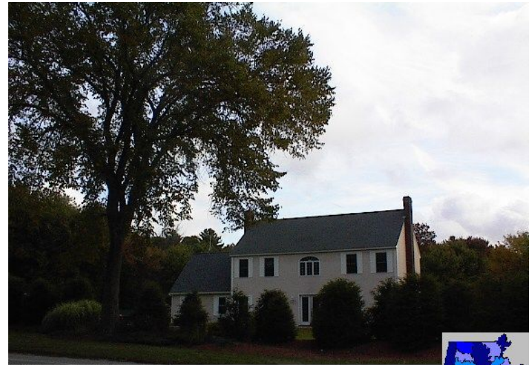
682 MILLVILLE RD